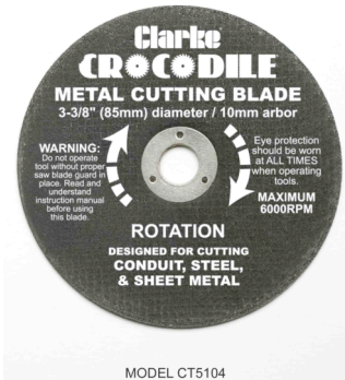
MODEL CT5104 METAL CUTTING BLADES FOR USE WITH CLARKE CT5000 CROCODILE SAW ONLY

PERRYSBURG, Ohio – Clarke® Power Products Inc. has introduced the Crocodile Circular Saw®, which provides the ergonomics and balance of an angle grinder, while delivering the incredible cutting power of a circular saw. This powerful, compact saw has few limitations. It is outfitted with four, 3 ¼-in.-diameter blades, capable of