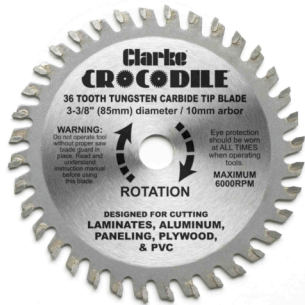
MODEL CT5102 36 TOOTH TUNGSTEN CARBIDE TIP BLADE FOR USE WITH CLARKE CT5000 CROCODILE SAW ONLY