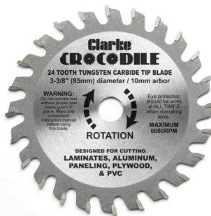
MODEL CT5101 24 TOOTH TUNGSTEN CARBIDE TIP BLADE FOR USE WITH CLARKE CT5000 CROCODILE SAW ONLY