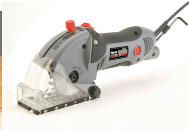
MODEL CT5000 CROCODILE CIRCULAR SAW