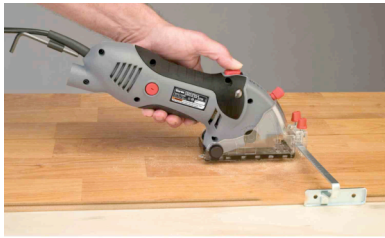
MODEL CT5000 CROCODILE CIRCULAR SAW CUTTING LAMINATE FLOORING