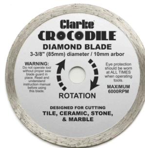
MODEL CT5103 DIAMOND BLADE FOR USE WITH CLARKE CT5000 CROCODILE SAW ONLY