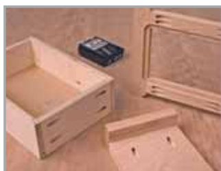
Perfect for 1/2" material where smaller Pocket-Holes are needed