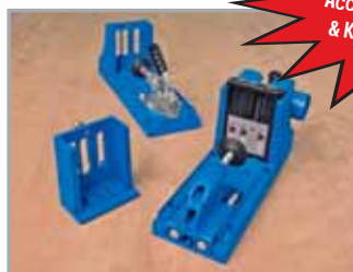
Works with all of our Kreg Jig® & Kreg Jig® Master Systems