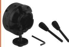
4" - 4 JAW SCROLL CHUCK 1" - 8