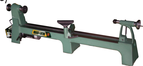
23" BED EXTENSION FOR 40" BETWEEN CENTERS